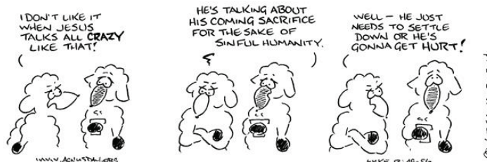
Agnus Day appears with the permission of www.agnusday.org